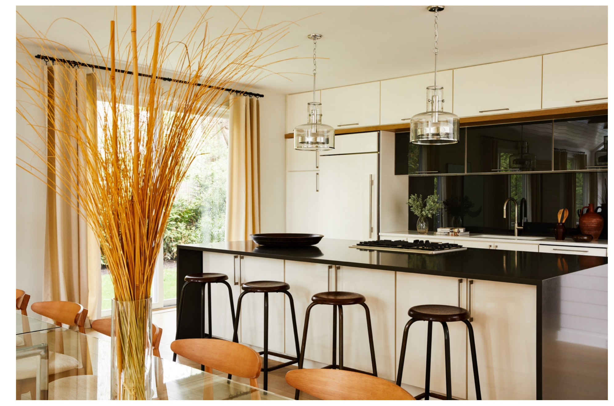
The kitchen balances modern appliances with local features.

"We saw an opportunity in its vacant state for the perfect backdrop for the East Coast version of our successful West Coast concept-the creative control of a space so we can build our business and show people what we do while representing the property for our market," says Bowen. "We've been operating in the Hamptons with our staging office since last year, but this is our first show house in the area where we can say, 'Come to one of our staged homes.'"